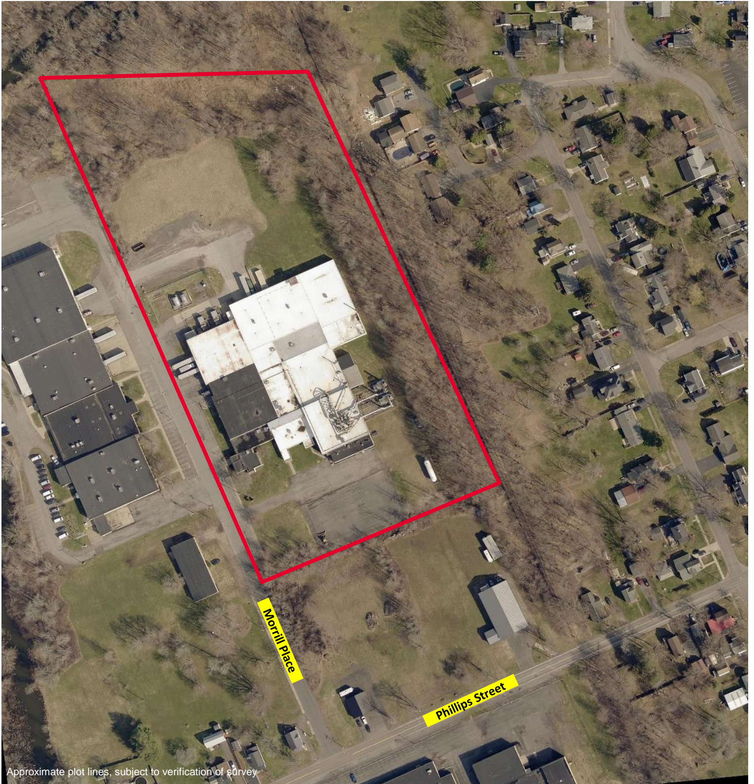
Approximate plot lines, subject to verification of survey