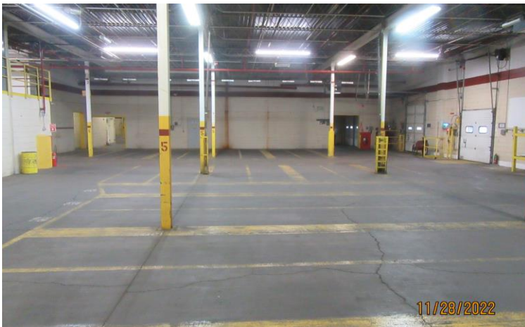
Raw Stock Warehouse